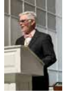
Governor Jim Campbell