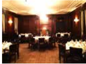
Duquesne Club Dining Room

Thank you to everyone who attended the celebration. It was wonderful.