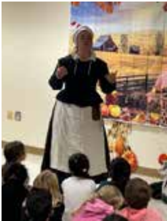
Plimoth Patuxet Interpreter talking with elementary school children about the Mayflower and Pilgrim life.