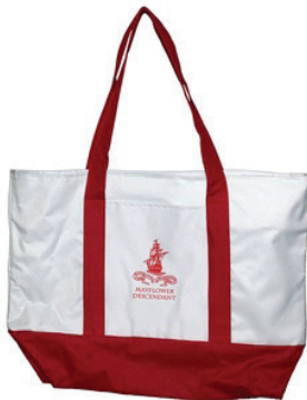
Large Zippered Boat Tote $32.00

Measures 1½” in diameter. ALL proceeds benefit the SMDPA Education program.