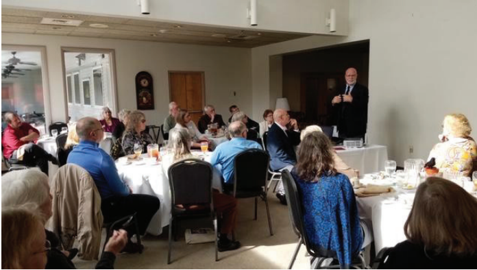
Attendees enjoying the guest speaker

The Susquehanna Colony of the Society of Mayflower Descendants of Pennsylvania recently held their Fall Meeting and Luncheon on Saturday, October 26. The Berwick Golf Club was the setting and the beautiful Autumn day was spent overlooking the golf course.