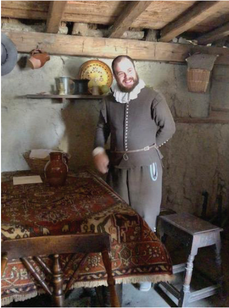
“Governor Bradford” at Plimoth Plantation

This year, in honor of the 400th anniversary of the coming of the Mayflower, we will be hosting reenactors from Plimoth Plantation. The reenactors will speak in schools in both colonies and in the Philadelphia area. October 26-30 a reenactor will visit schools in the Susquehanna Colony area. November 2-6 a reenactor will be in the Western Colony area. November 9-13 a reenactor will visit schools in the Philadelphia area.