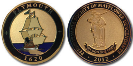
SMDPA Commemorative Coin $15.00

SMDPA commemorative Mayflower coin is die-struck in solid brass, with fine detail and vivid colors. The front features the Mayflower sailing on a cobalt blue sea and is captioned “PLYMOUTH 1620”. The reverse features a Pilgrim couple relief surrounded by the caption “PENNSYLVANIA SOCIETY OF MAYFLOWER DESCENDANTS 2012.”